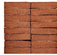
EW2207 Rød Mørk