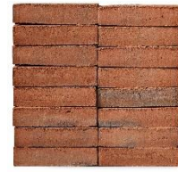
EW2260 Red Coal